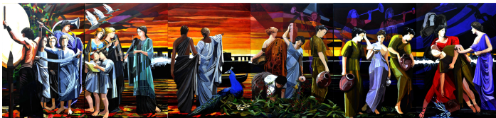
Here above - Interpretation pictorial dell'artista V. Rainieri