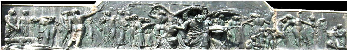
Interpretation of the Requiem sculptor E. Ximenes